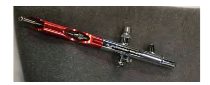
Bill's Harbor Freight air brush and air compressor.