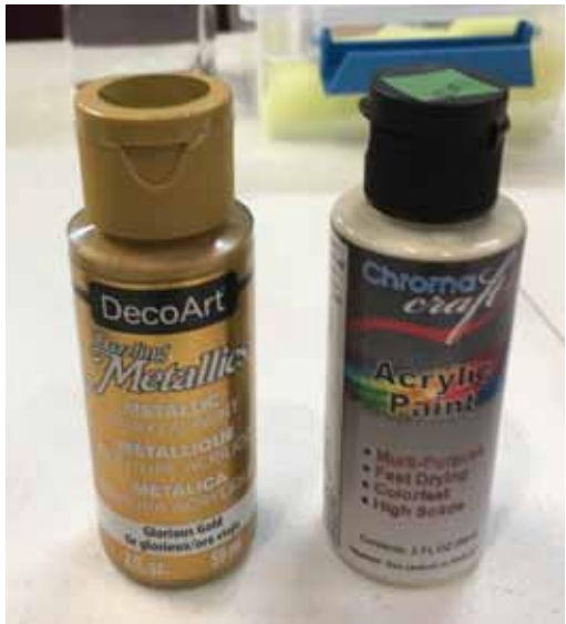
DecoArt Metallic and Chroma Craft Acrylic Paints available at art and craft stores or online.