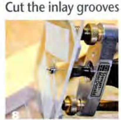
A shopmade router base and guide cut the grooves for the inlay.

I built a simple jig to hold the bowl blank on the drill press and on the bench; glimpses of the jig can be seen in Photos