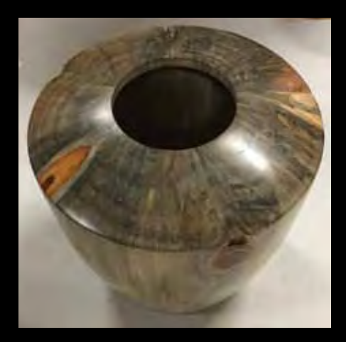
Norfolk Island Pine vase.