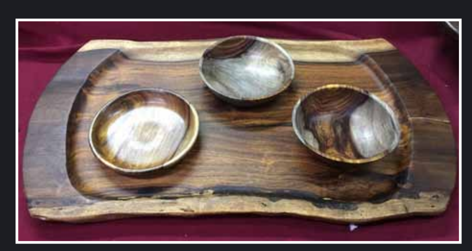
Pat Sullivan's Rosewood platter with bowls.