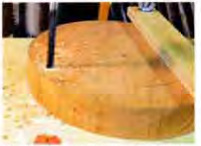
Cleanly cut holes ensure a perfect fit, so use a drill press for this step. A sharp drill bit, a shopmade holding jig, and additional clamps ensure quality holes for inlay.