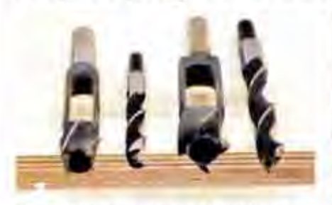
Terion cutters are capable of producing long plugs in side- or facegrain, and brad point bits of matching diameters cut clean holes to receive the plugs.