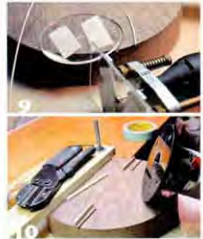
With small, flexible strips of veneer or solid wood as inlay material, curved or straight lines are possible, depending on the shape of template used to guide the router.