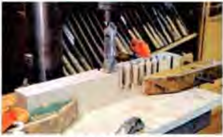
A single board can yield many plugs of varying diameters, and each plug may yield two or more pieces for inlay.