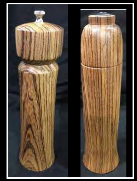
Tim Flow 's pepper mills from December 8 turning class.