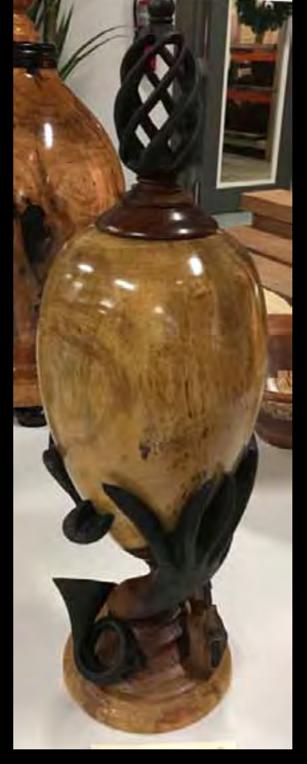
David Senecal's Turned vase with Elaborately Carved Base and Finial.