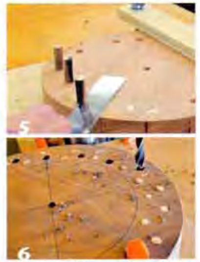
Flush-cut the first round of inlayed plugs after the adhesive has set, then return to the drill press for more holes. When you are satisfied with the inlay pattern, the next step is turning.