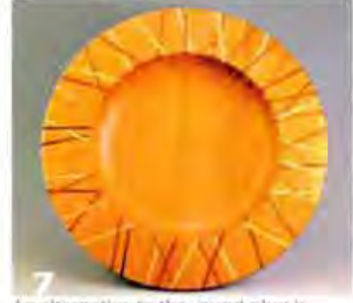
An alternative to the round plug is straight (or curved) linear inlay.

wood to make sure the fit of the plugs is exact. Once I match the drill bit to the plug cutter, the drill bits are never used for anything else. I replace the drill bit when it no longer cuts cleanly.