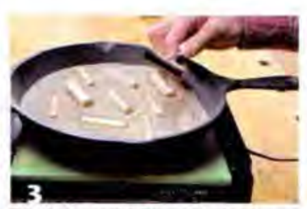
The plugs are carefully monitored as they are embedded in hot sand for shading. Watch closely to avoid over-sconching and keep the work area clear of flammable materials.