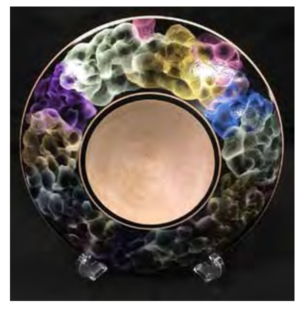
Iridescent Cosmic Flower Design.