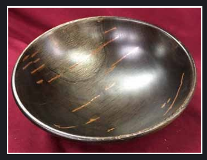
Bill Clark's Live Oak with Copper Powder/CA Inlays bowl.