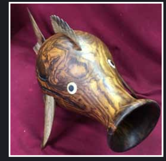
Pat Sullivan's Rosewood fish.